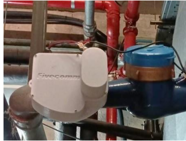
Figure 3. The 5G-LITE device (left) connected to a water meter (right) in a trial.

supports LTE NarrowBand IoT (NB-IoT) and CAT-M configurations, and low power wide area (LPWA) technologies.