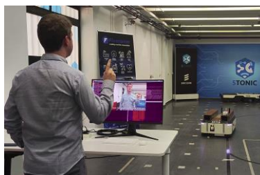
Figure 5. Fivecomm software platform used in the context of 5G-INDUCE for remote control of AGVs.

Finally, our third main line of products is a software platform for 5G use cases including NetApps that have been developed, further enhanced, and integrated in the context of several 5G-PPP projects. A good example of this integration is the 5G-INDUCE project. In this project, we performed a trial to show the great potential of 5G network slicing through the development, integration, and validation of an AI-based human gesture recognition NetApp for controlling robots. The proof-of-concept showed end-to-end orchestration for full slicing life cycle support and radio resources partitioning, offering a key differential user experience to customers. A similar use case has been validated in the context of INGENIOUS , an EU-IoT project where we integrated the use of haptic gloves and VR glasses for controlling larger AGVs that usually operate outdoors. A third great example of our successful integration of NetApps into our software platform (and in other platforms for end-to-end orchestration) is the 5G-IANA project. In this case, we are currently developing an end-to-end application for remote driving with 360 lidar and ML video-based object detection.