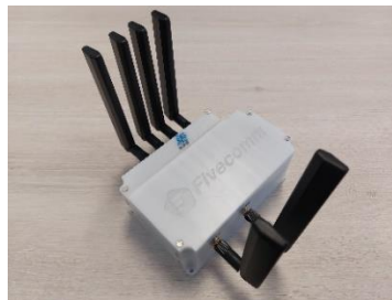
Figure 1. 5G BROAD device developed at Fivecomm.

Thanks to 5G-PPP projects such as FUDGE-5G, Fivecomm has developed the 5G BROAD router designed for connecting user devices to 5G networks through Ethernet or USB. It comes with an open operative system based on OpenWRT that permits any user to configure it and make changes in an easy manner. It has been integrated into the framework of several projects into multiple networks with different vendors, with NSA and SA, low-band and mid-band, being these projects the main testing framework for the product.