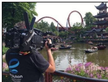
Figure 2. 5G portable device for professional video cameras, used in the 5G-RECORDS trials.

In the 5G-RECORDS project, Fivecomm went one step further and provided a portable 5G-connected device attachable to professional video cameras for media production scenarios. The whole solution is formed by our 5G module, an NVIDIA Jetson Xavier as encoder, and an SDI video capture card, all enclosed in an ad hoc 3D printed case plugged to the camera. The device was successfully demonstrated in the wireless studio final trials in June 2022, proving its potential.