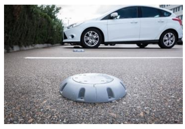
Figure 1: WINGS Smart Parking device deployed at AIA

WINGS has success stories in all the main vertical areas that it addresses: utilities, food security, smart city applications, and industry / logistics.