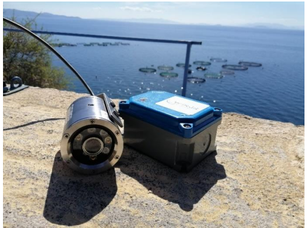
Figure 2: Camera to be installed underwater, for monitoring the production, and to transmit through cabling and 4G/5G.

In the area of utilities & infrastructures, WINGS is deploying its smart parking solution at Athens International Airport in the context of 5G-TOURS and at a municipality in Central Greece. The WINGSPARK solution provides the means for effective real-time monitoring and management of on-street parking slots, municipal as well as private parking lots. The technology foundation comprises IoT (Internet of Things) parking devices with embedded intelligence able to detect the presence of a vehicle with high reliability, a cloud-based platform enabling real-time monitoring and management and algorithms for forecasting of parking availability as well as a mobile application for the drivers. The WINGSPARK mobile application aims at enhancing the user experience by providing useful insights for parking spaces occupancy and trends when searching for a parking spot, while reducing unnecessary driving and thus fuel consumption and CO<sub>2</sub> emissions. The solution is also integrated with third party components such as ANPR cameras, LED displays, barriers and payment kiosks.