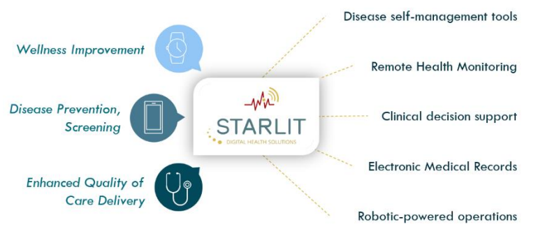
Figure 5: WINGS offering through STARLIT platform.

in the context of its participation in the VITAL-5G<sup>4</sup>, DEDICAT 6G<sup>5</sup> and Hexa-X<sup>6</sup> Horizon projects, and is utilizing advanced technological concepts such as warehouse digital twin, AI/ML predictive resource utilization & predictive maintenance, geofencing and more.