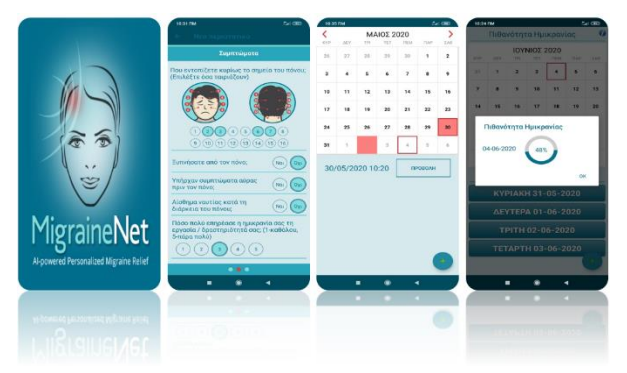
Figure 6: MigraineNet mobile application.

Through our work in the H2020 DeepHealth project we deliver solutions for the prediction of migraines, seizures, and the progression of depression, while also exploiting the capabilities of High Performance and parallel computing.